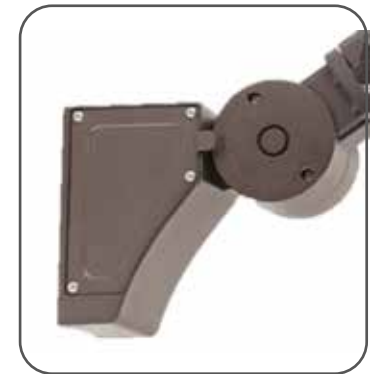
Adjustable Arm Mount